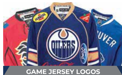
GAME JERSEY LOGOS