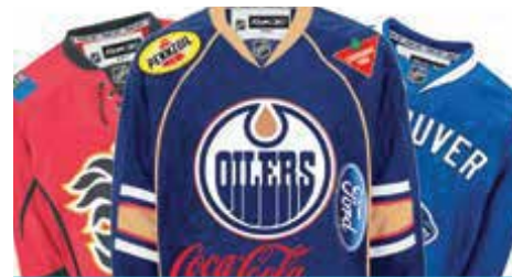
GAME JERSEY LOGOS